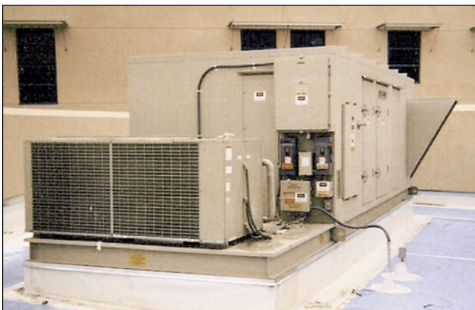
An Oasis™ DX unit installed on the WNCC's classroom and laboratory complex.

Using Typical Meteorological Year (TMY) data for Reno, NV, Figure 1 illustrates the month by month ton-hour refrigeration cooling requirements per 1,000 cfm of the Oasis™ compared to the more conventional air handling unit system, with an air-side economizer introducing a maximum of 30% outdoor air on a design day. Based on furnishing 50°F supply air, it is clear that the all outdoor air design using evaporative cooling allows the owner to put his/her refrigeration system to bed earlier