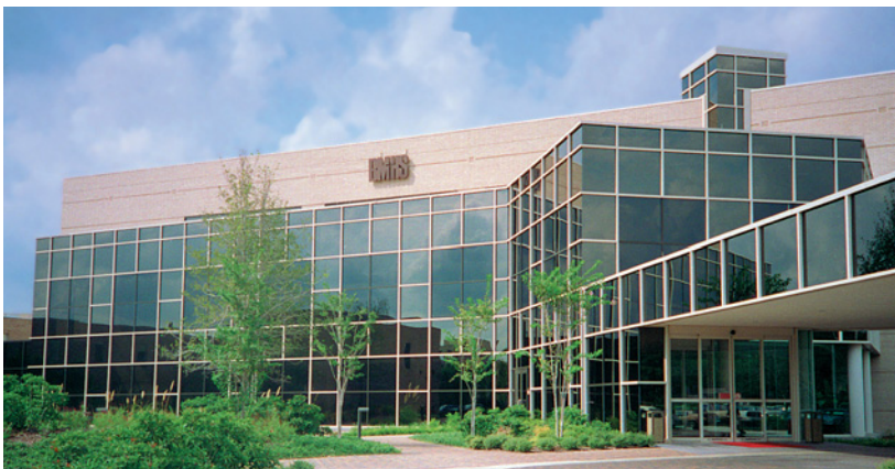
At Northeast Baptist Hospital, a MDAire desiccant system allowed major improvements in comfort control for the operating rooms. The entire project was completed without a single interruption of surgery schedules.

In the 20 years since the original HVAC system began operation, surgical practice has undergone several major change which increase the burden on the cooling system. Advanced procedures require the surgeon to spend longer periods in the OR. Increased power consumption from lights and electronic monitoring equipment has more than doubled the sensible heat load. At the same time, surgeons must gown more heavily to avoid the hazards of diseases such as HIV which are transmitted through exchange of body fluids. All of these changes require more cooling, so surgeons need room temperatures of 62 to 64°F instead of the 70 to 72° that was common years ago.