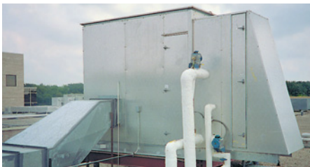
Because the MDAire system was installed on the roof and connected at the fresh air inlet, it was easy to retrofit and upgrade the old HVAC system without interrupting normal hospital operations.

Each surgeon can set the room temperature he or she requires. The humidity is held at 50% rh automatically, without affecting conditions in adjacent rooms. This is accomplished by drying the air for all rooms to a low level with the MDAire system, then re-humidifying any