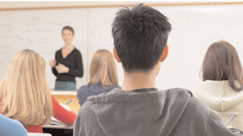
Fairfield University houses approximately 2600 students.

The Fairfield University campus consists of 200 acres with 34 major buildings including 8 student residence halls and 105 town-house units. Fairfield University houses approximately 2600 students, and over 95% of the incoming class lives on campus. First year students live in one of four traditional residence halls. All halls are coed by floor or by wing and have commonly shared lounges, usually on each floor.