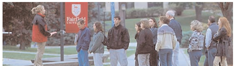
Fairfield University provides campus tours to new students and their parents.

"Munters rentals and sales divisions are to be commended, the knowledge and input from all with what we had to deal with was of the highest caliber. I was an outside contractor for 27 years before I came to Fairfield. I had seen Munters units in action before; they are definitely the Cadillac of their class."